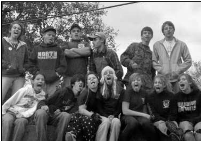
Say Cheese....or maybe not. Venture Scout Crew 63 takes time out from a very productive workday to pose for a group shot.