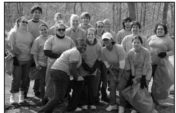
Warren County Community College student volunteers collected 30 bags of trash at the Penwell site in the MWA Annual Spring Clean Up.