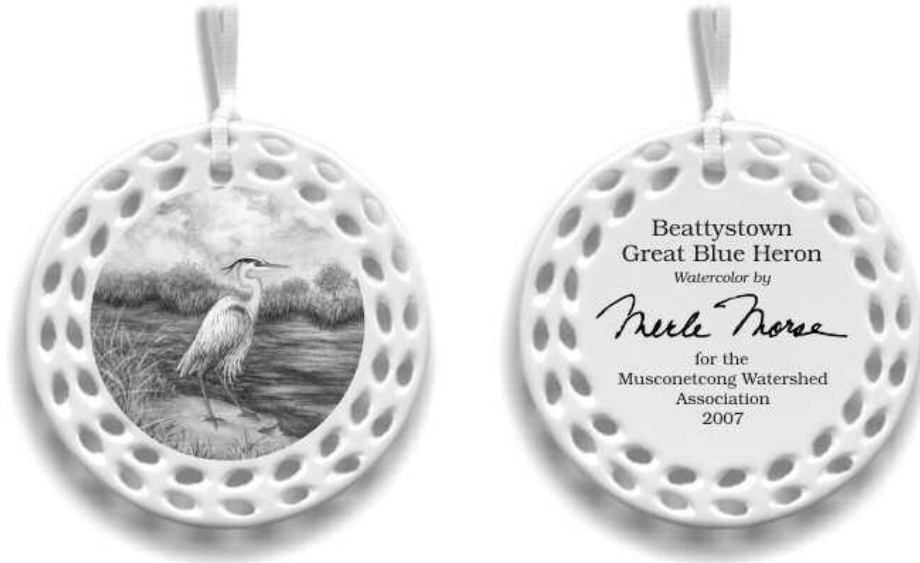
Shown: front design, reverse is signed and dated. Actual size 3.5”