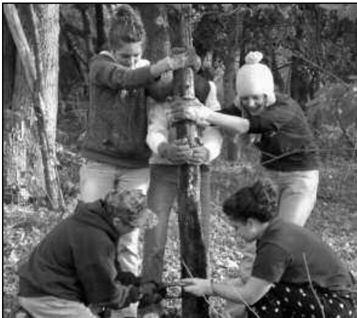
Many Hands Make Light Work The Venture Scouts removed deadwood, cut back vegetation and cleared debris from the 1.3-mile trail at the River Resource Center.