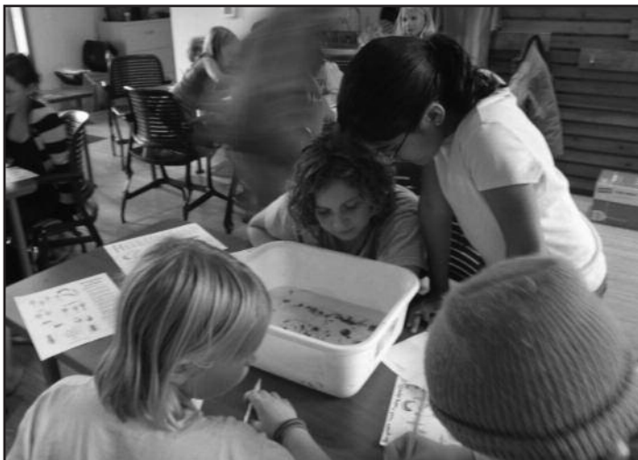
In October a group of 16 local home schooled students experienced the MWA Watershed Education program. In this photo, students sketch and classify macroinvertebrates from a sample they pulled from the river.