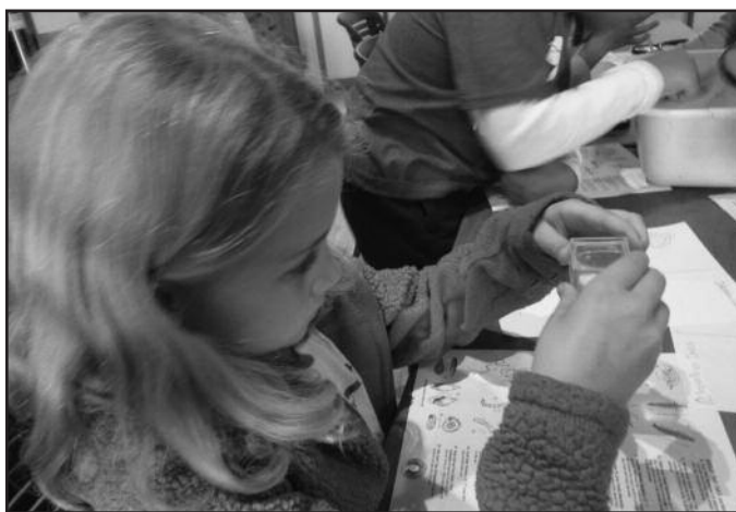
After a lesson about the meaning of finding certain aquatic insects in the Musconetcong River, it is time to identify organisms.