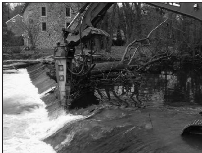
Removal of the Finesville Dam began on November 10, 2011. Gleim Environmental Group of Carlisle PA removed the dam using a design by Princeton Hydro engineers of Ringoes, NJ

Flooding The dam at Finesville, like most other dams on the Musconetcong River, raised the hydraulic level of the River during flood events, increasing the vulnerability of local lands to flooding. The dam pool or mill pond occupies part of the natural floodplain of the river. Dam removal creates access to flood plain area and allows the river to swell considerably during heavy rains before it