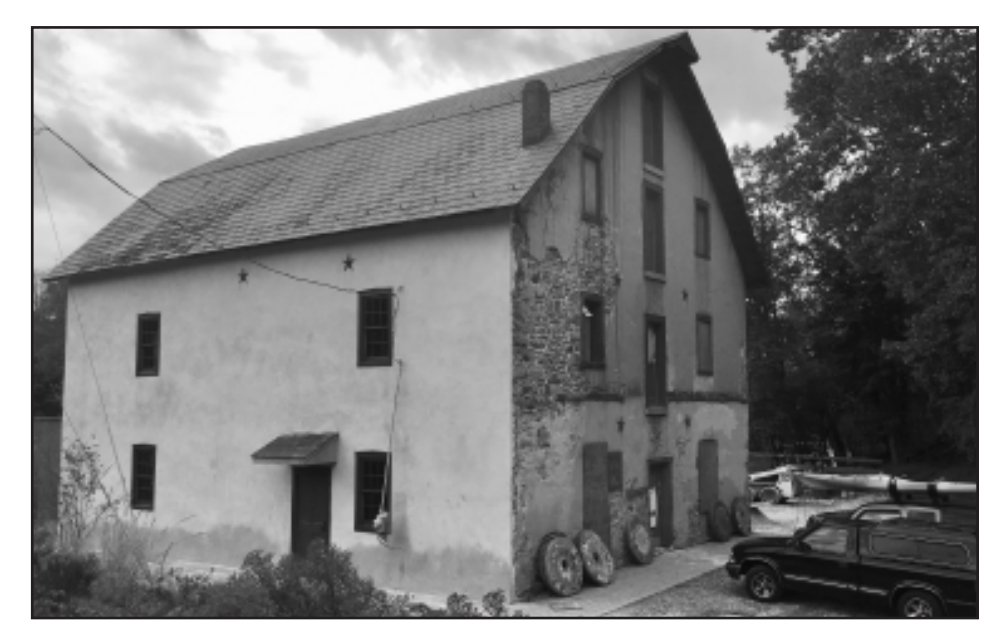
Asbury Mill East wall with new stucco

We are always looking for support for the project. Yes, we need funding, but we also need bright ideas as we work toward completion. Contact MWA if you want to put your donations and ideas to work.